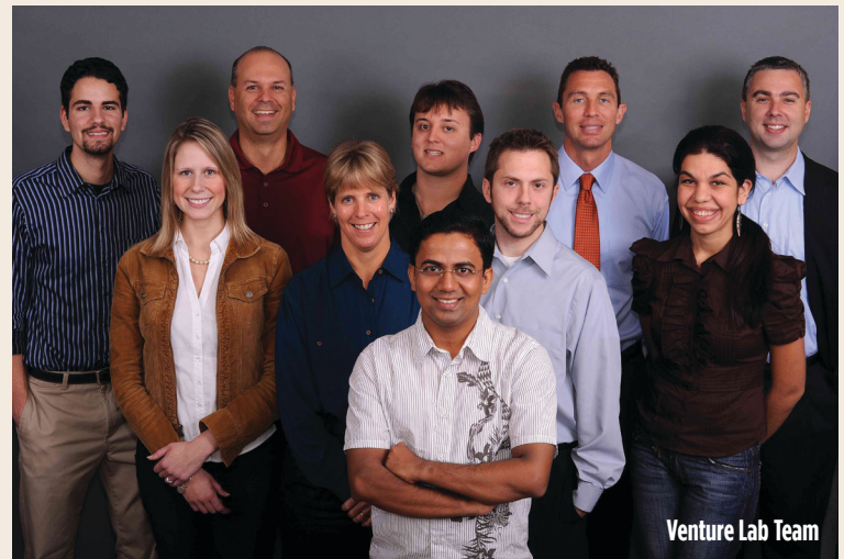
Venture Lab Team

The Venture Lab is a joint initiative between the UCF Office of Research and Commercialization, the UCF College of Business, Orange CONTINUED ON PAGE 3